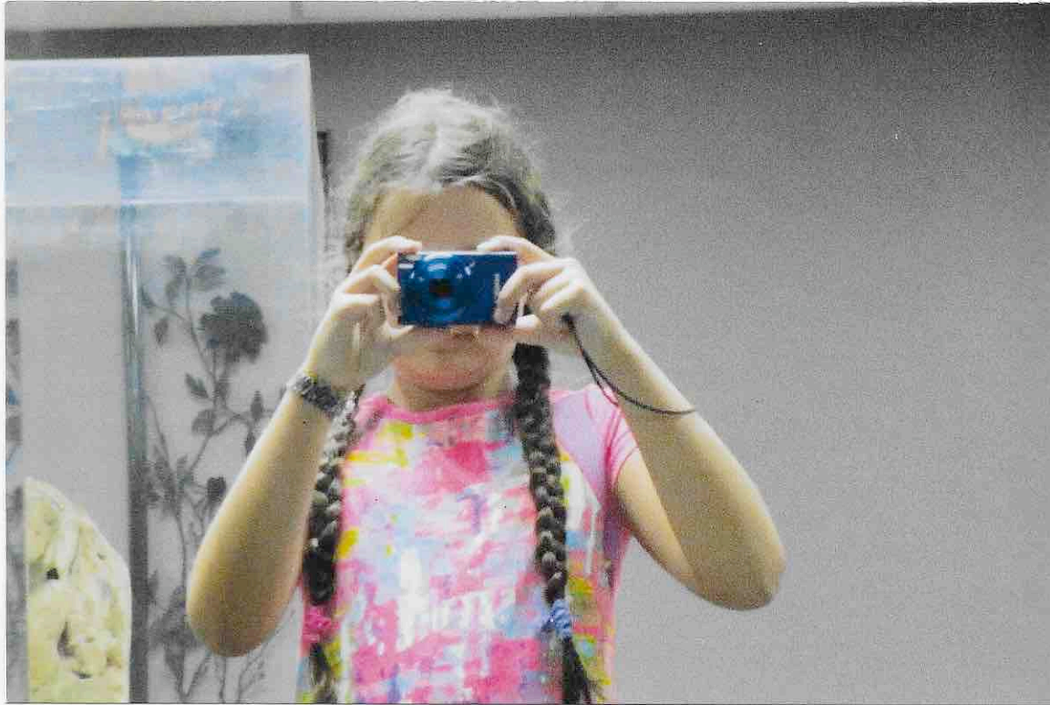
me taking a picture in a mirror outside the museum ←